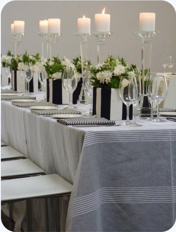
Table linen from Table Art